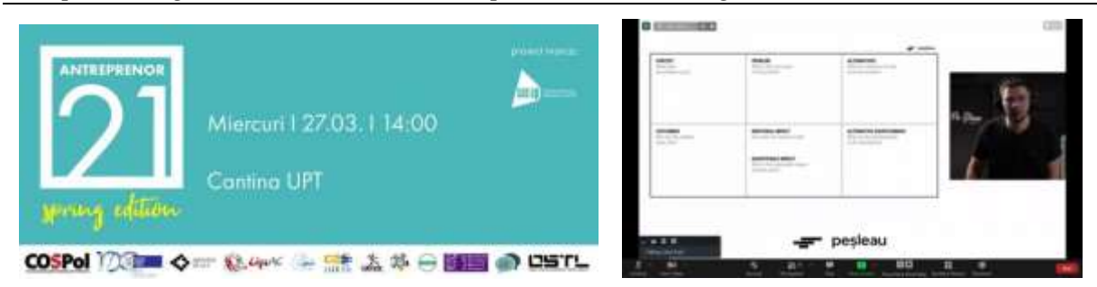
Figure 11. ENTREPRENOR 21 - Spring Edition and Start up Your Future workshops