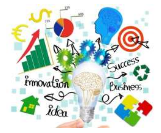
Figure 7. "Constructor AntREprEnoR - CAREER" Business Plan Competition