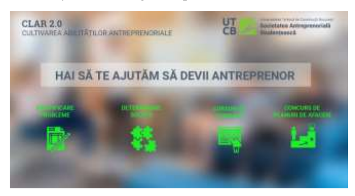
Figure 8. "Cultivating Entrepreneurial Skills - CLAR 2.0" Project

In 2020 the first start-up was launch among students or graduates of the Technical University of Constructions from Bucharest by "Cultivating Entrepreneurial Skills - CLAR 2.0" project, figure 8.