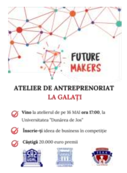
Figure 5. Future Makers Entrepreneurship Workshop

- the organization of the second edition of Future Makers entrepreneurship workshop, in which discussions were held about future trends, as well as how future entrepreneurs can generate sustainable business ideas, figure 5.